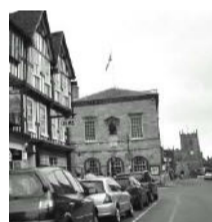
Guild Chapel Grammar School Alms Houses